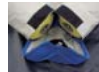
DBI inflation ports