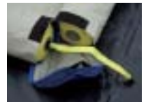
DBI inflation hose