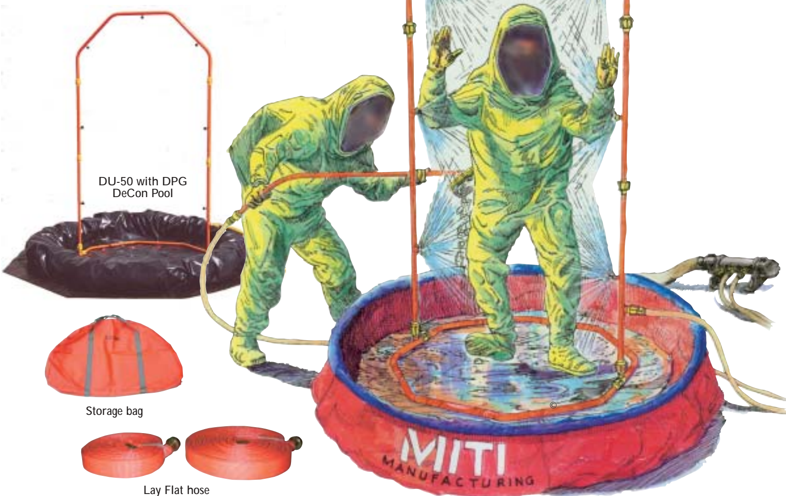
DU-50 with DPG DeCon Pool

DUSB50 Replacement DeCon Hoop storage bag