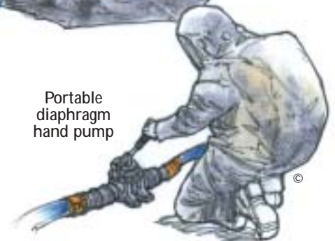
Portable diaphragm hand pump