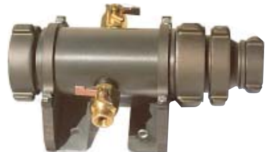
MMIL2515-2 (PAT PEND)