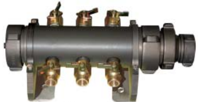
MMIL2515-6 (PAT PEND)

MITI's In-Line Multi-Manifold broadens the scope of Multi-Manifold use and application, and provides the ability for additional manifolds or other devices to be connected downline from the source, while simultaneously providing multiple 3/4" hose outlets in line. Applications include decontamination, overhaul, wild land fire, disaster and domestic emergency water supply. Constructed of durable corrosion-free hard coated heavy wall aluminum pipe and fittings. Fitting/adapters provide for attachment to either 2 1/2" or 1 1/2" FM coupling or hose. Connects to source at hydrant/apparatus and multiple 3/4" hose. 500psi certified 1/4-turn brass ball valves.